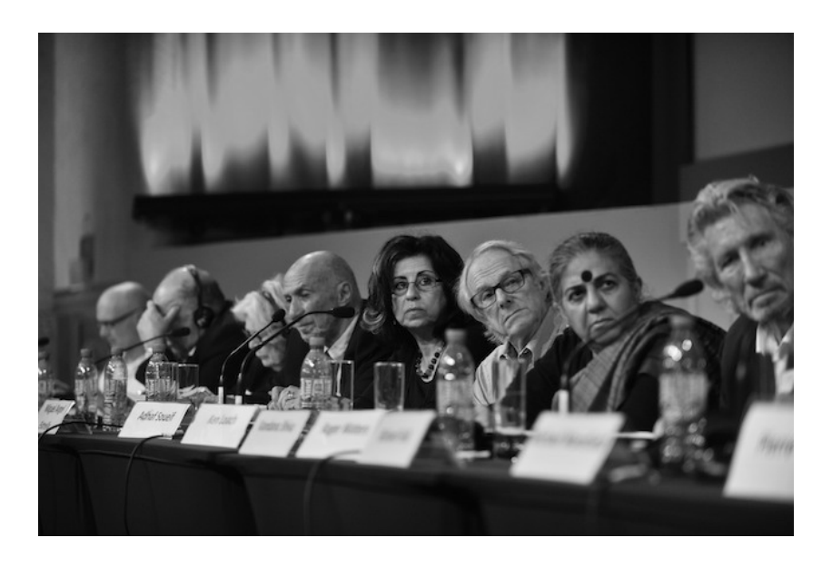
The Russell Tribunal, Brussels, September 2014

problem in fighting Israeli "apartheid" was "the weaponization of antisemitism." The problem, Falk concurred, was the working definition of antisemitism by the International Holocaust Remembrance Alliance (IHRA), which labeled as antisemitic libelous falsehoods concerning Israel but not critique of Israel as such. Zionists, Falk said, had a "powerful punitive tool by which to deflect pro-Palestinian activism by brand-ing adherents as antisemites."130 The argument over the 2016 IHRA working definition of antisemitism is beyond the scope of this essay. 131