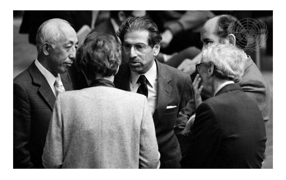
Yehuda Blum, Israeli Ambassador to the United Nations, June 1982

maps according to their expansionist plans. . . . What difference is there between the Israeli bloodbaths inflicted on thousands of innocent children and civilians in Lebanon today and the Nazi holocaust?"73