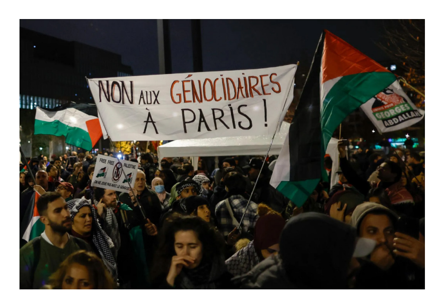
Demonstration before France-Israel Football Match, November 2024

the genocide convention was completed, we can begin to deconstruct the charge itself, how it has been used against Israel over time, and the stunningly bad faith behind the genocide accusation.