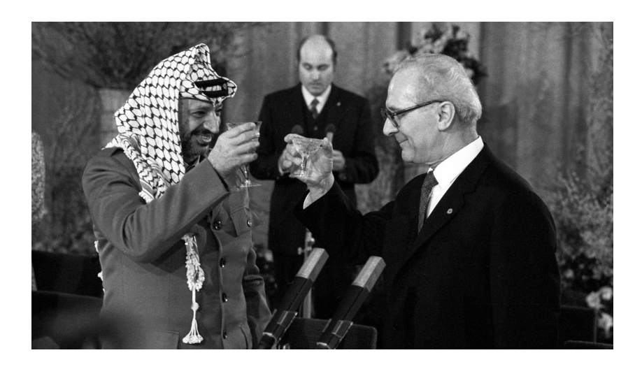
Yasser Arafat and East German leader Erich Honeker in East Berlin, 1982

ambitious stages were to flow from the initial aim and yet were to appear unplanned to the outside world. Sharon convinced Prime Minister Menachem Begin that the war would be over quickly.<sup>53</sup>