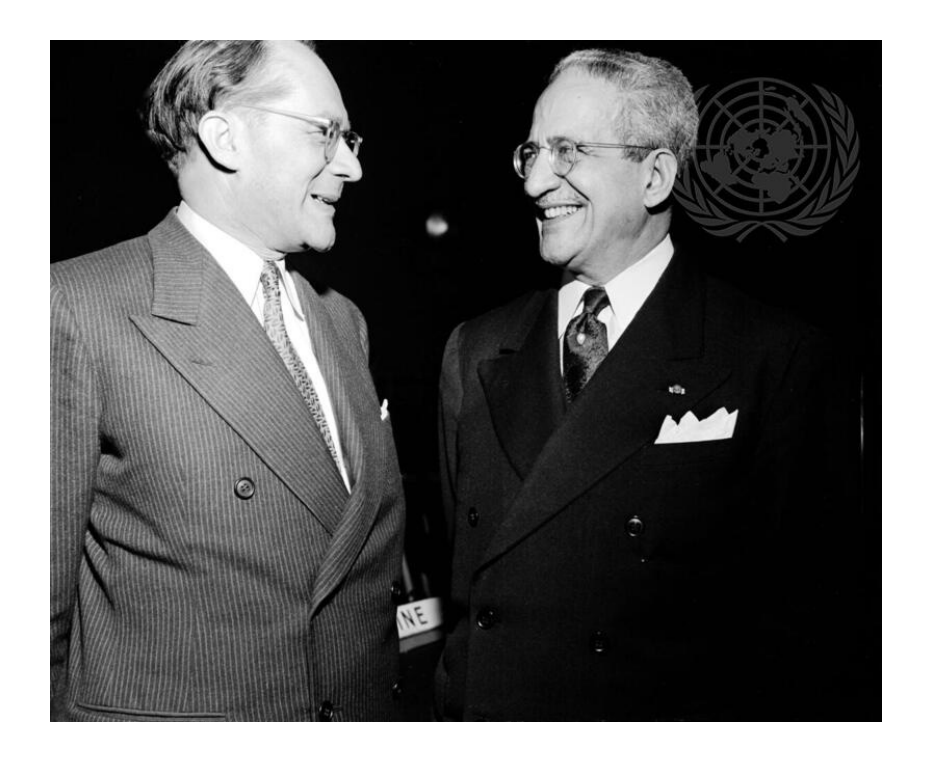
Raphael Lemkin and Ricardo Alfaro of Panama, chairman of the UN General Assembly Legal Committee, December 1948, UN Photo.

the intent to destroy, in whole or in part, a national, ethnical, racial, or religious group, as such." The actual acts begin with "killing members of the group," and the rest of the definition also concerns physical destruction. The convention thus includes provisions such as the prevention of births within the group, but it consciously omits broader concepts such as cultural genocide.24